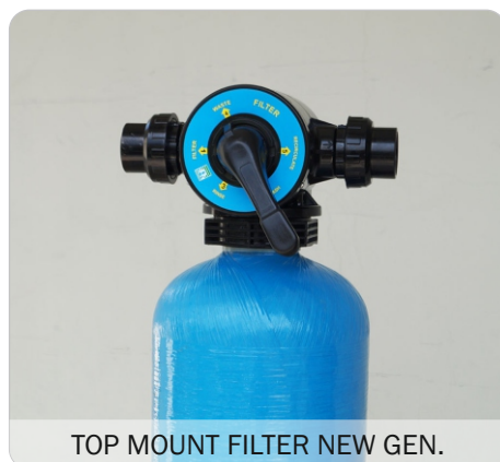
TOP MOUNT FILTER NEW GEN.