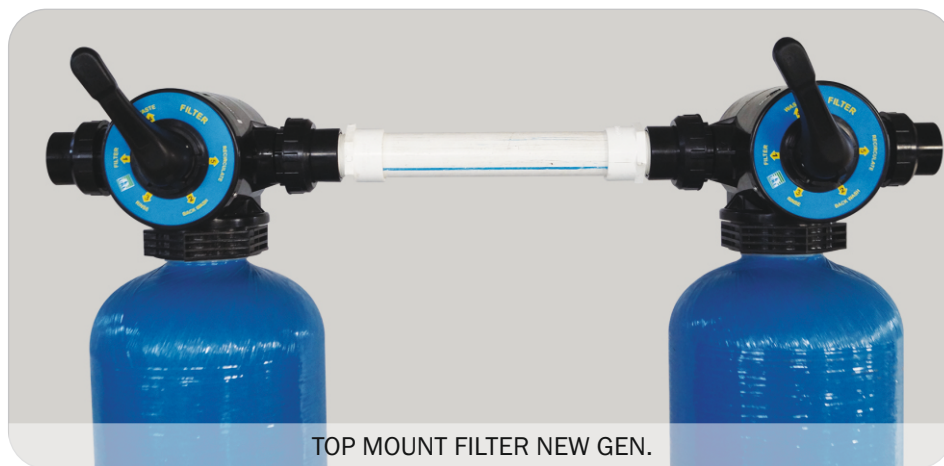
TOP MOUNT FILTER NEW GEN.