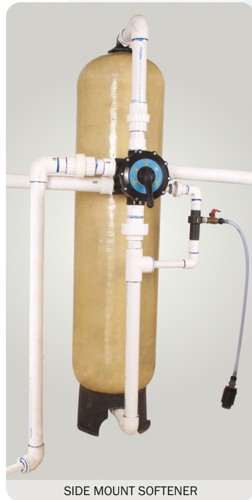
SIDE MOUNT SOFTENER