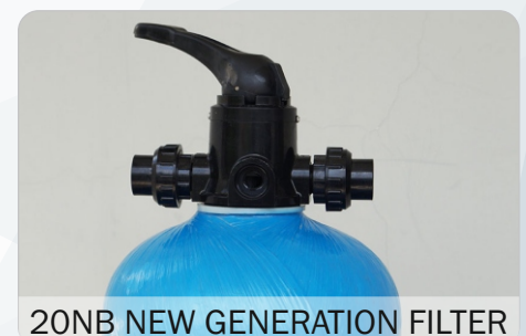
20NB NEW GENERATION FILTER