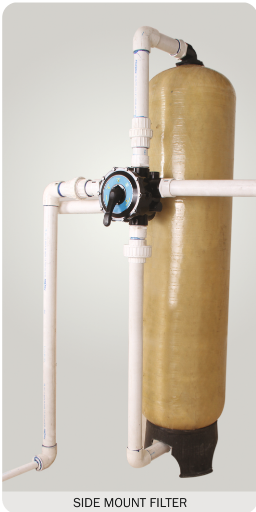
SIDE MOUNT FILTER