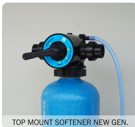
TOP MOUNT SOFTENER NEW GEN.