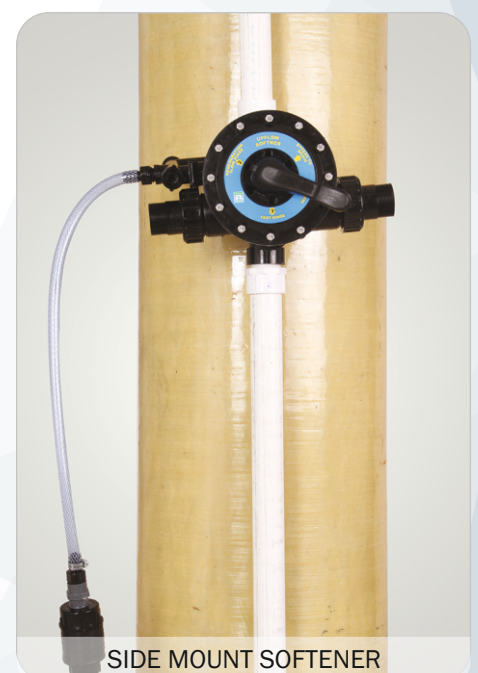
SIDE MOUNT SOFTENER