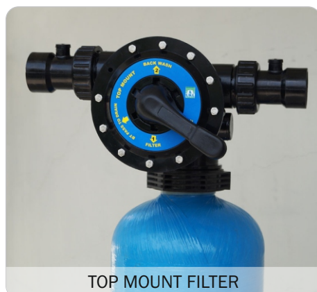
TOP MOUNT FILTER