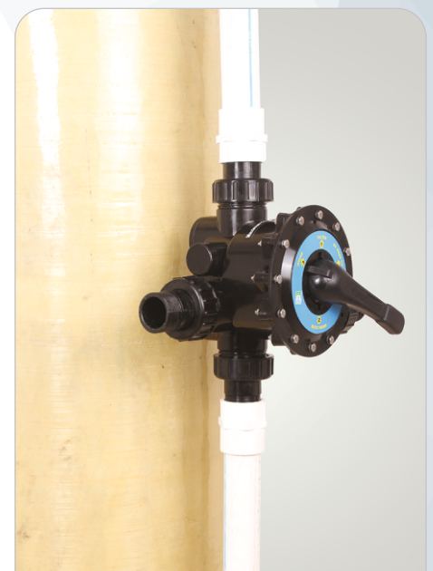
SIDE MOUNT FILTER W/STRAIGHT UNIONS