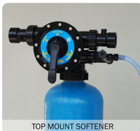
TOP MOUNT SOFTENER